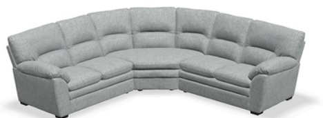
4-Seat Corner Curve Sectional