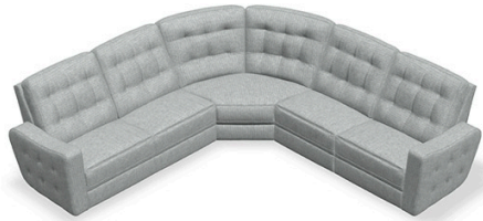
4-Seat Corner Curve Sectional with Three Triple Power Recliners