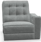
66 RHF Power Recliner w/ Power Headrest