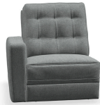
67 LHF Power Recliner w/ Power Headrest