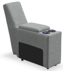
K2 Console w/Storage