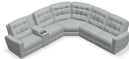
5-Seat Bumper Sectional

L2/K2/L3/9X/10/L1 137 x 124" 348 x 315 cm