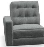
L2 LHF Pwr Recl Pwr/HR Pwr Lumbar