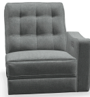
L1 RHF Pwr Recl Pwr/HR Pwr Lumbar