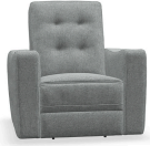
31 Wallhugger Power Recliner w/ Power Headrest

39 x 41 x 42" 100 x 103 x 107 cm IA: 23" / 59 cm