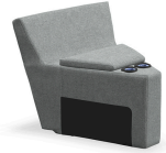
K1 Wedge 45 Degree w/Storage