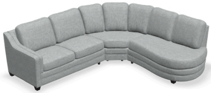
4-Seat Bumper Sectional

Inside Arm (IA): Refers to the distance between the arms.