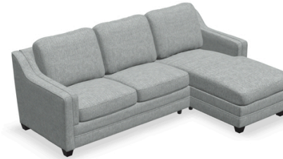
3-Seat Chaise Sectional