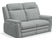
63 Loveseat Power Recliner w/ Power Headrest

91 x 40 x 40" 230 x 101 x 101 cm IA: 70" / 178 cm