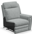
66 RHF Power Recliner w/ Power Headrest