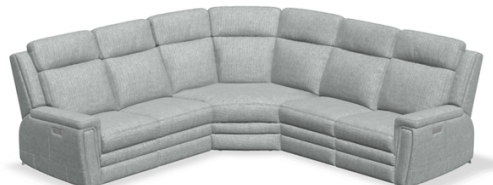
4-Seat Corner Curve Sectional with Three Recliners

67/W2/10/09/10/66 119.4 x 106.3" 304 x 271 cm