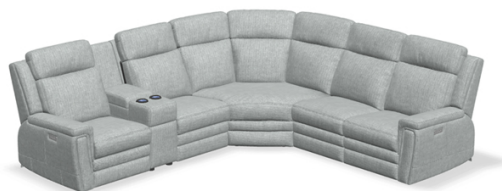
4-Seat Corner Curve Sectional with Storage Console and Three Recliners

67/10/09/6H/66 106.3 x 106.3" 271 x 271 cm