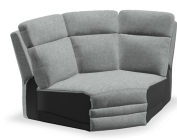
09 Corner Curve

Note: Icon images are for illustrative purposes only and may not be an exact representation of the product. Please refer to the product photography for the most accurate representation. Left-hand Facing (LHF): Refers to the arm or bumper being on the left side of the piece when you are facing it. Right-hand Facing (RHF): Refers to the arm or bumper being on the right side of the piece when you are facing it. Inside Arm (IA): Refers to the distance between the arms.