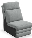
10 Armless Chair