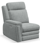
67 LHF Power Recliner w/ Power Headrest