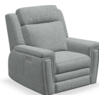
31 Wallhugger Power Recliner w/ Power Headrest

44 x 40 x 40" 111 x 101 x 101 cm IA: 23" / 59 cm