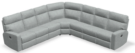
6-Seat Corner Curve Sectional with Three Manual Recliners

Inside Arm (IA): Refers to the distance between the arms.