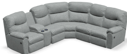
5-Seat Corner Curve Sectional with Storage Console and Three Power Recliners

67/A2/10/09/10/66 114 x 101" 290 x 257 cm