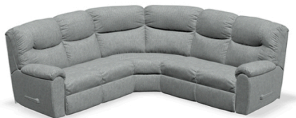
4-Seat Corner Curve Sectional with Two Manual Recliners

67/A2/10/09/60/66 114 x 101" 290 x 257 cm