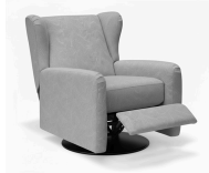
M2 Swivel Pushback Recliner

34 x 39 x 41" 87 x 100 x 103 cm IA: 23" / 59 cm