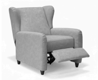
62 Pushback Recliner

33 x 37 x 36" 84 x 93 x 92 cm IA: 23" / 58 cm