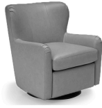
G3 Swivel Glider

34 x 39 x 41" 87 x 100 x 103 cm IA: 23" / 59 cm